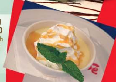
カスタードプリン $3.00 Savory taste of smooth & silky pudding is just unbearable!