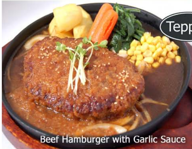
Beef Hamburger with Garlic Sauce