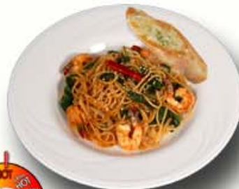
Chili Shrimp & Spinach エビとほうれん草のピリ辛ソース $13.00 Shrimp, spinach, & onions with spicy chili sauce.