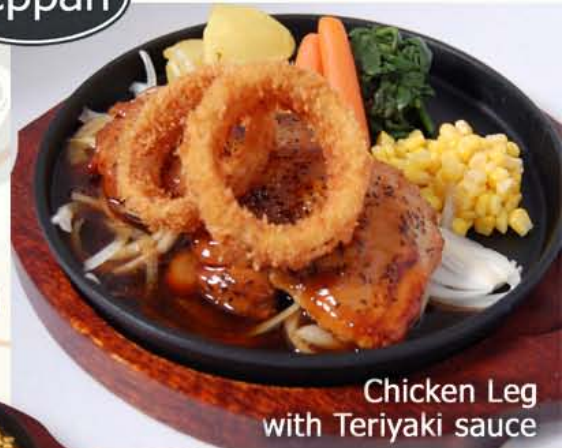
Chicken Leg with Teriyaki sauce