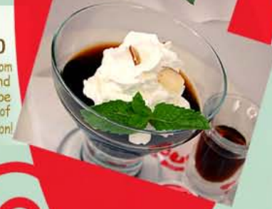
コーヒーゼリー $3.00 This coffee jello is made from grinding the original blend of coffee beans. You'll be surprised by the deep taste of coffee and the silky sensation!