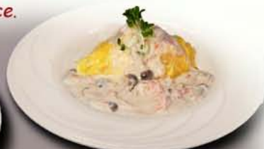
Crab & Shrimp Omelet Rice