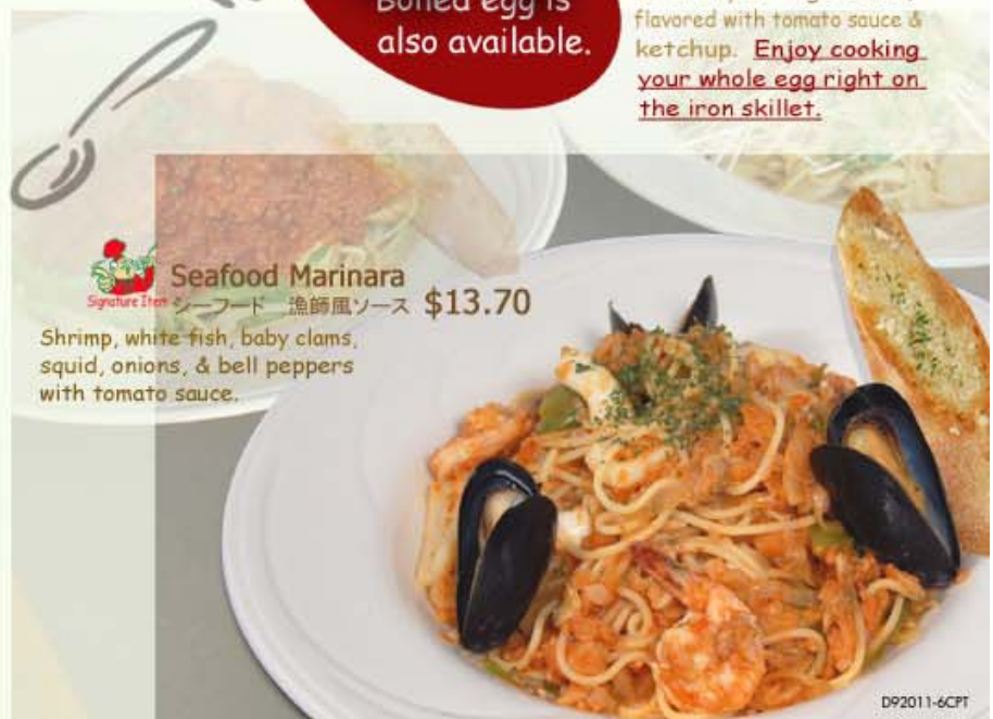
Seafood Marinara シーフード 漁師風ソース $13.70 Shrimp, white fish, baby clams, squid, onions, & bell peppers with tomato sauce.