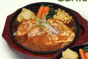
Chicken Leg with Garlic Sauce

Grilled chicken leg with a sweet traditional Japanese teriyaki sauce & homemade onion rings on top. Served with seasonal vegetables.