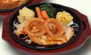
Chicken Breast with Teriyaki Sauce