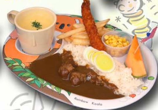
Kid's Curry Rice キッズカレーライス $5.40

Teriyaki chicken (breast meat), rice, corn potage, fried shrimp, french fries, corn, & fruit.