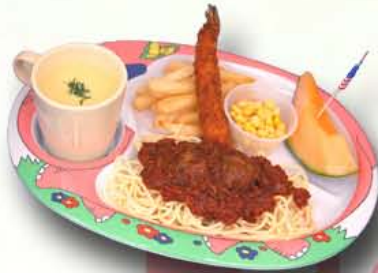
Kid's Spaghetti キッズスパゲティ $5.40

Meat or curry sauce spaghetti, meatballs, corn potage, fried shrimp, french fries, corn, & fruit.