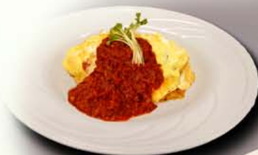
Spicy Omelet Rice