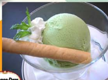
アイスクリーム $3.25 Choice of Vanilla, Green Tea or Red Beans.

*Garnishes may vary from the photos. 付け合せは写真と異なる場合があります。