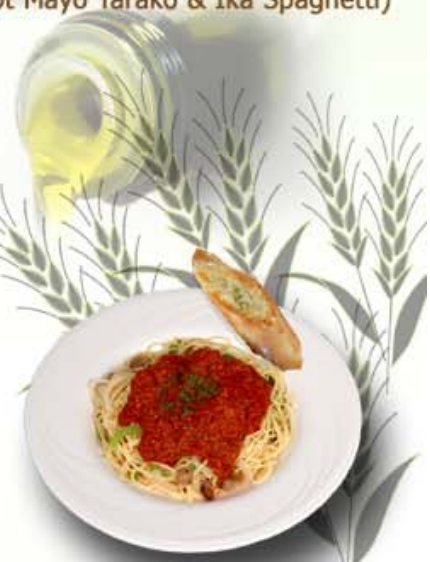
Meatball Bolognese ミートボールとミートソース $12.10 Sautéed onions, mushrooms, bell peppers, & meatballs with meat sauce.