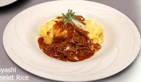
Hayashi Omelet Rice