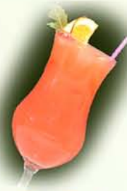
Fruit Punch フルーツパンチ

$4.25 Choice of Lime, Coke, Coffee or Cherry.