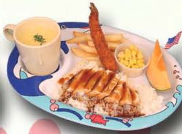
Kid's Teriyaki Chicken キッズてりやきチキン $5.95

Meat or curry sauce spaghetti, meatballs, corn potage, fried shrimp, french fries, corn, & fruit.