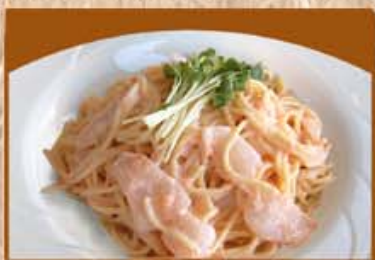
Mayo Tarako & Ika

Cooked with savory gourmet delicious shimeji & eringi mushrooms, grilled with onions & kaware in soy sauce based flavoring.