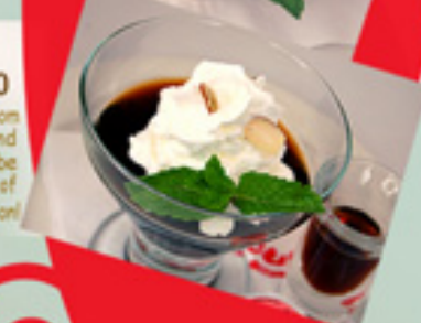
コーヒーゼリー $3.00 This coffee jello is made from grinding the original blend of coffee beans. You'll be surprised by the deep taste of coffee and the silky sensation!

*Garnishes may vary from the photos. 付け合せは写真と異なる場合があります。