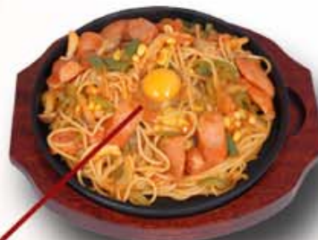
Teppan Neapolitan 鉄板ナポリタン $9.65

エビとほうれん草のピリ辛ソース $9.75 Shrimp, spinach, & onions with spicy chili sauce.