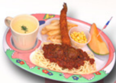
Kid's Spaghetti キッズスパゲティ $5.20

Meat or curry sauce spaghetti, meatballs, corn potage, fried shrimp, french fries, corn, & fruit.