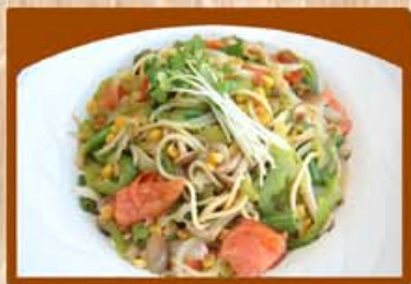
Vegetable Japanese 和風 ベジタブル $8.15

are used to prepare all our spaghetti in this section. (Except Mayo Tarako & Ika Spaghetti)