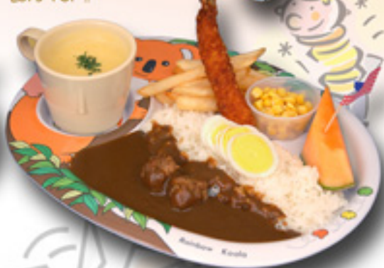
Kid's Curry Rice キッズカレーライス $5.20

Teriyaki chicken (breast meat), rice, corn potage, fried shrimp, french fries, corn, & fruit.