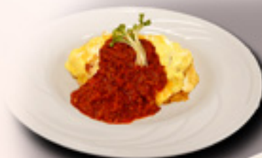
Spicy Omelet Rice

* These items are not served with curry sauce.