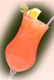
Fruit Punch フルーツパンチ