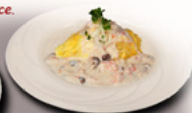
Crab & Shrimp Omelet Rice