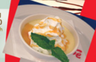
カスタードプリン $3.00 Savory taste of smooth & silky pudding is just unbearable!