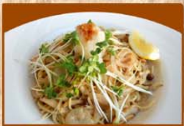
Kinoko & Kaiware きのこことかいわれ $9.30

Enjoy 7 different blends of vegetables: tomatoes, onions, shimeji, bell peppers, corn, green beans & kaware mixed into freshly cooked spaghetti in soy sauce based flavoring.