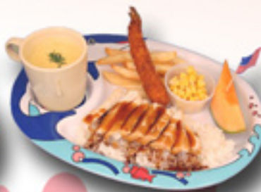
Kid's Teriyaki Chicken キッズてりやきチキン $5.75

Meat or curry sauce spaghetti, meatballs, corn potage, fried shrimp, french fries, corn, & fruit.