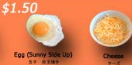
Egg (Sunny Side Up) 玉子 卵玉焼き Cheese チーズ