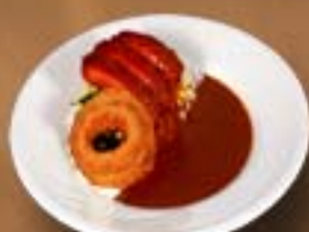
Wiener, Spinach & Onion Rings ウィナー、ほうれん草とオニオンリング $12.10