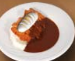
Chicken Katsu & Boiled Egg チキンカツと卵で卵 $12.20