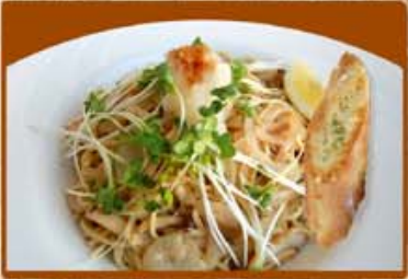
Kinoko & Kaiware きのこかいわれ $10.25

Enjoy 7 different blends of vegetables: tomatoes, onions, shimeji, bell peppers, corn, green beans & kaiware mixed into freshly cooked spaghetti in soy sauce based flavoring.