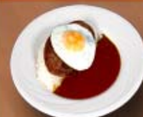
Hamburger & Egg ハンバーグと卵玉焼き $12.70