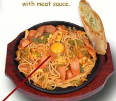
Teppan Neapolitan 鉄板ナポリタン $10.55

Shrimp, spinach, & onions with spicy chili sauce.