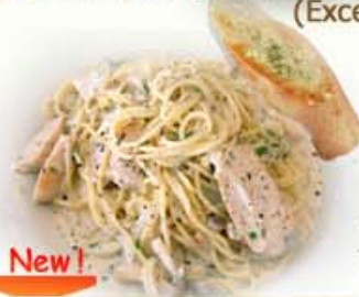
New! Creamy Chicken & Shimeji $11.15 チキンとしめじのクリームソース Grilled chicken breast, sautéed onions, & shimeji mushroom with white cream sauce. Fresh black pepper on top.

Fresh squid & cod roe mixed with mayonnaise. Original is also available. (no mayonnaise)