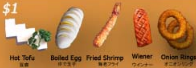
Hot Tofu 豆腐 Boiled Egg 卵で玉子 Fried Shrimp 揚げエビ Wiener ウィナー Onion Rings オニオンリング