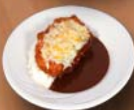
Chicken Katsu & Cheese チキンカツとチーズ $12.70