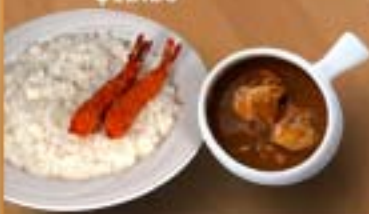
Chicken Curry & 2 Fried Shrimp チキンカレーと揚げエビ $11.70