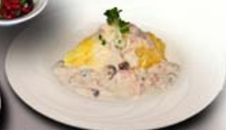
Crab & Shrimp Omelet Rice