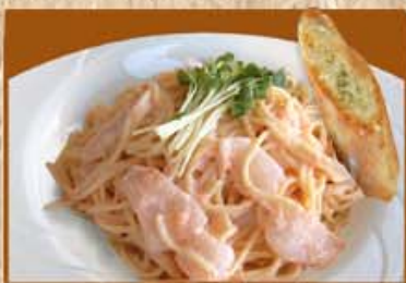
Mayo Tarako & Ika タラコとイカのマヨネーズ味 $10.65

Cooked with savory gourmet delicious shimeji & eringi mushrooms, grilled with onions & kaiware in soy sauce based flavoring.