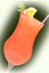
Fruit Punch フルーツパンチ

$3.95 Choice of Lime, Coke, Coffee or Cherry.