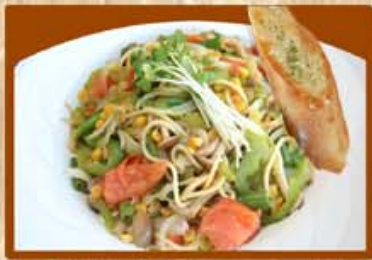
Vegetable Japanese 和風 ベジタブル $9.15

are used to prepare all our spaghetti in this section. (Except Mayo Tarako & Ika Spaghetti)