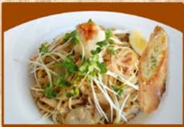
Kinoko & Kaiware きのこかいわれ $10.25

Enjoy 7 different blends of vegetables: tomatoes, onions, shimeji, bell peppers, corn, green beans & kaiware mixed into freshly cooked spaghetti in soy sauce based flavoring.