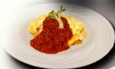
Spicy Omelet Rice