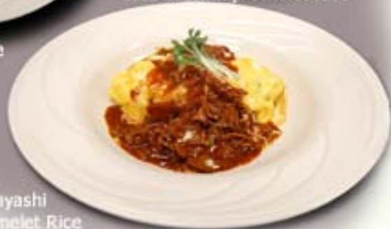
Hayashi Omelet Rice

* These items are not served with curry sauce.