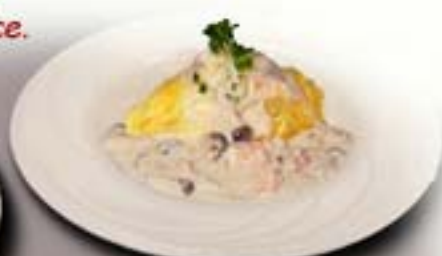
Crab & Shrimp Omelet Rice