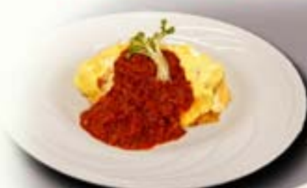
Spicy Omelet Rice

* These items are not served with curry sauce.