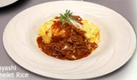
Hayashi Omelet Rice